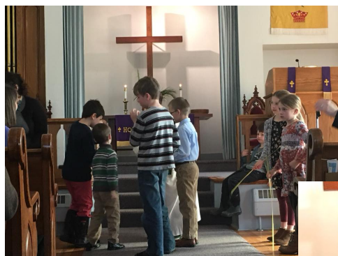
Learning how to make a cross on Palm Sunday