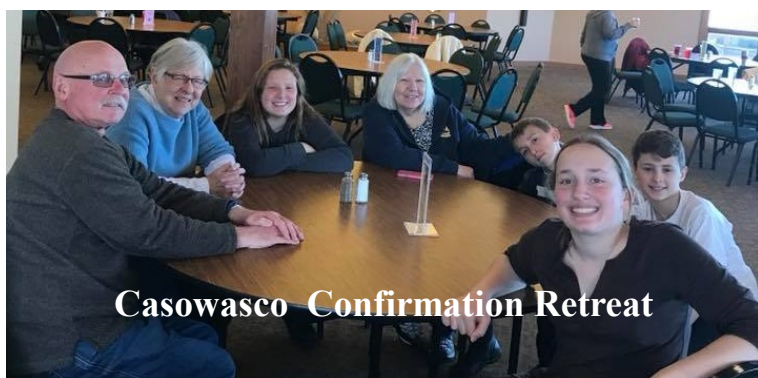
Casowasco Confirmation Retreat