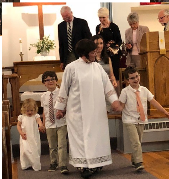
A trio were baptized on Trinity Sunday